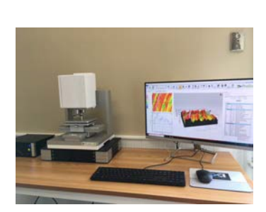
SWLI/3D surface mapping